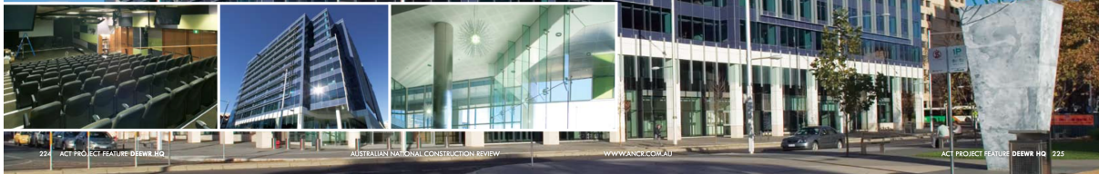
224 ACT PROJECT FEATURE DEEWR HQ

WALKER CORPORATION Level 21 Governor Macquarie Tower 1 Farrer Place Sydney NSW 2000 t. 02 8273 9600 f. 02 9252 7400 www.walkercorp.com.au